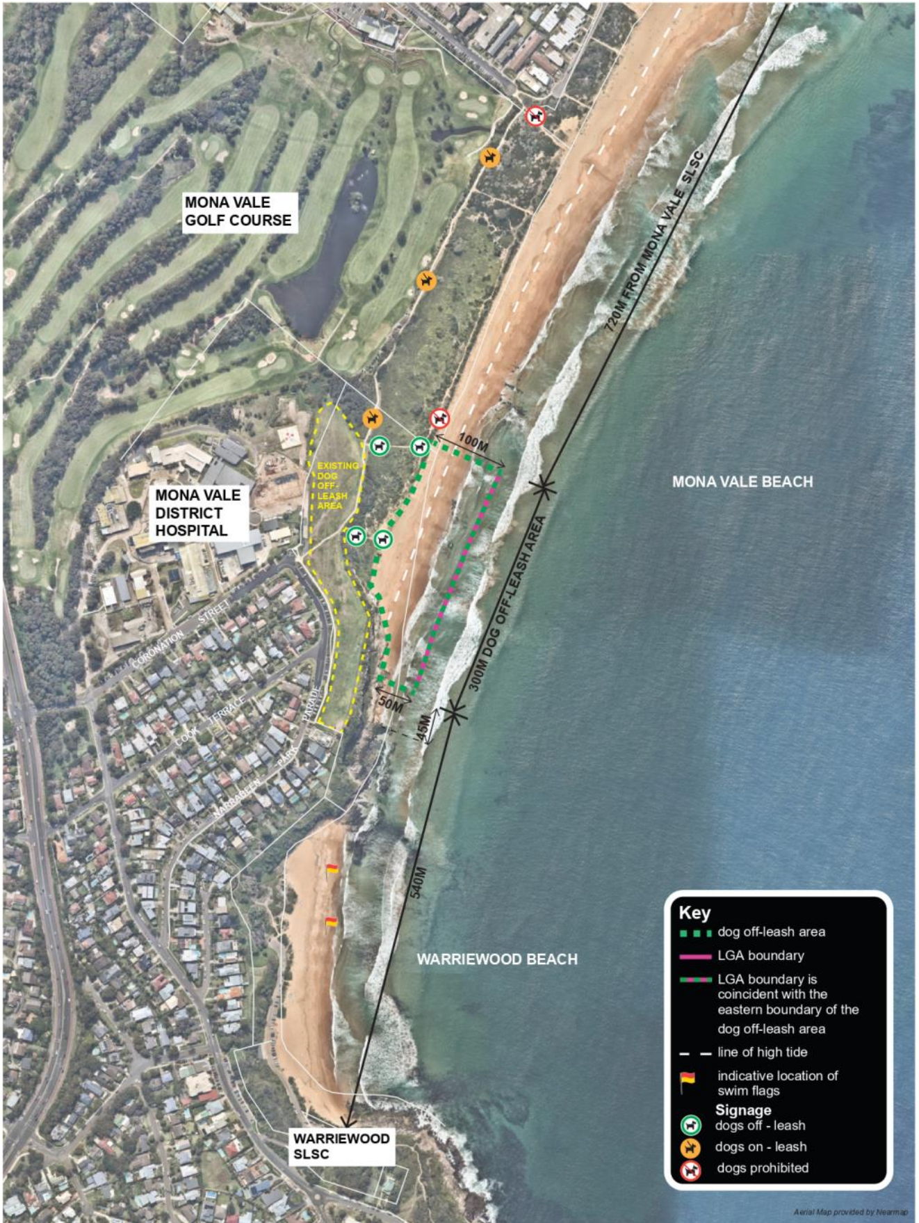
Aerial Map